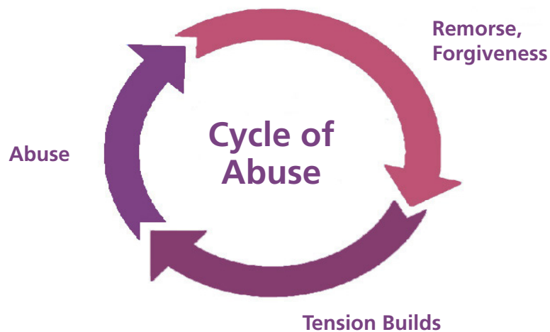
Figure 2: The Cycle of Abuse: Diagram illustrating the cyclic nature of domestic abuse