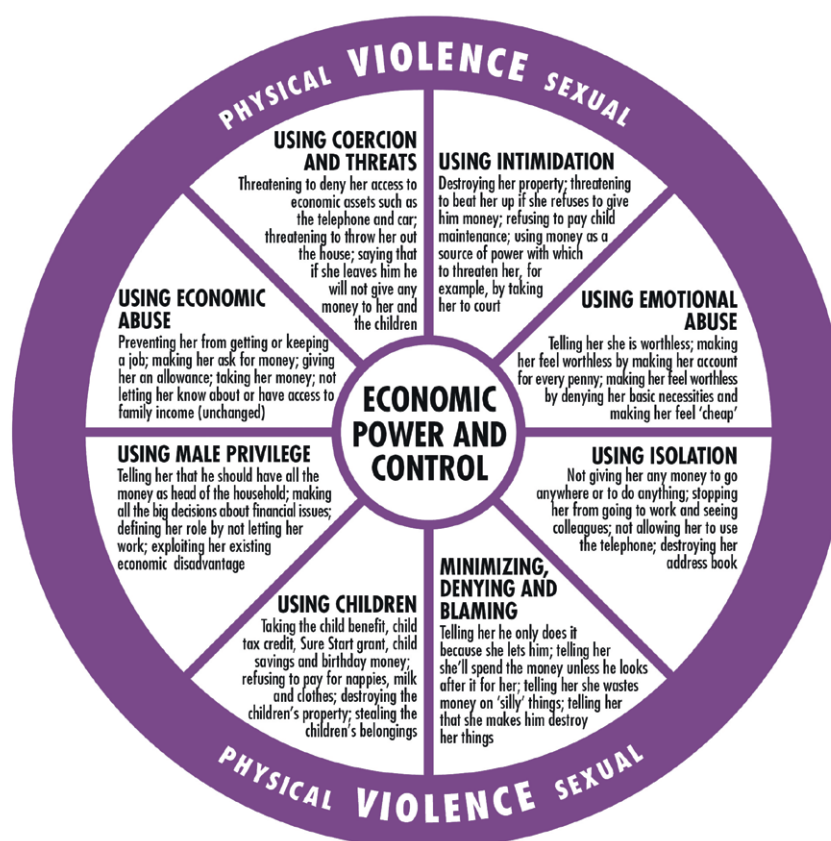
Figure 1: The economic abuse wheel