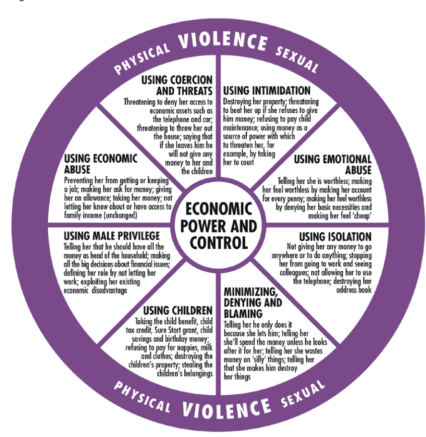
Figure 1: The economic abuse wheel