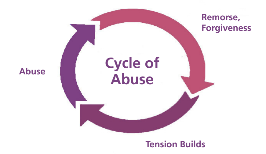
Figure 2: The Cycle of Abuse: Diagram illustrating the cyclic nature of domestic abuse