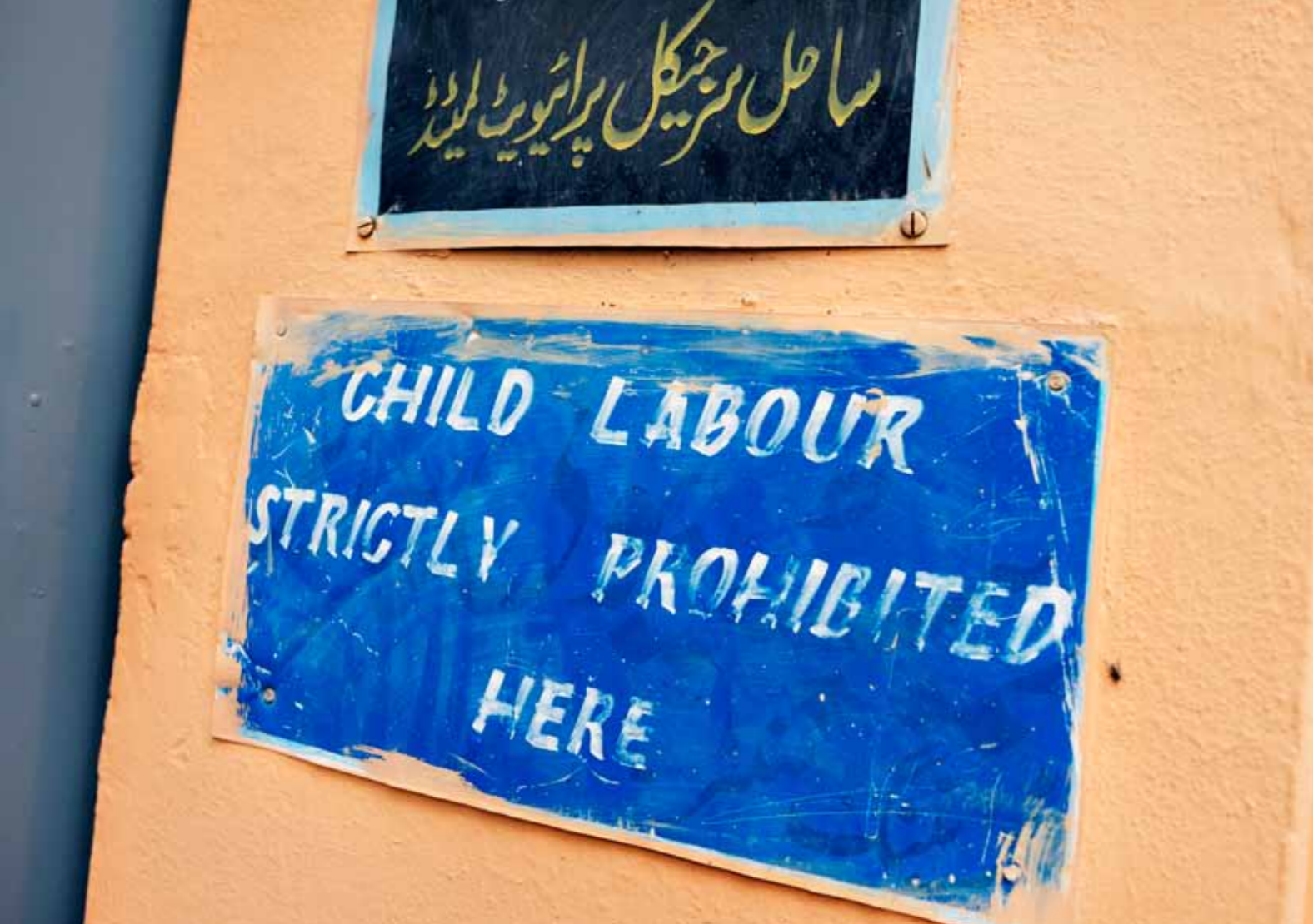
Prohibition of child labour is now strictly enforced at the exporting factories and their sub-contractors.

The lack of unions in the industry still indicates that freedom of association is not respected. The difference compared to previous reports is that the workers now say that they do not see the need for a union, whereas workers previously felt that starting a union would lead to dismissal. The workers appear no longer to think that unions might get them fired, but they may lack awareness regarding the role of a union as well as awareness regarding their rights. In order to fully realize freedom of association, employees need to be trained on labour rights and the role of unions. However, such efforts may be hampered by legal barriers to the formation of unions in Pakistan, and by the strong resistance to unionisation by many employers.