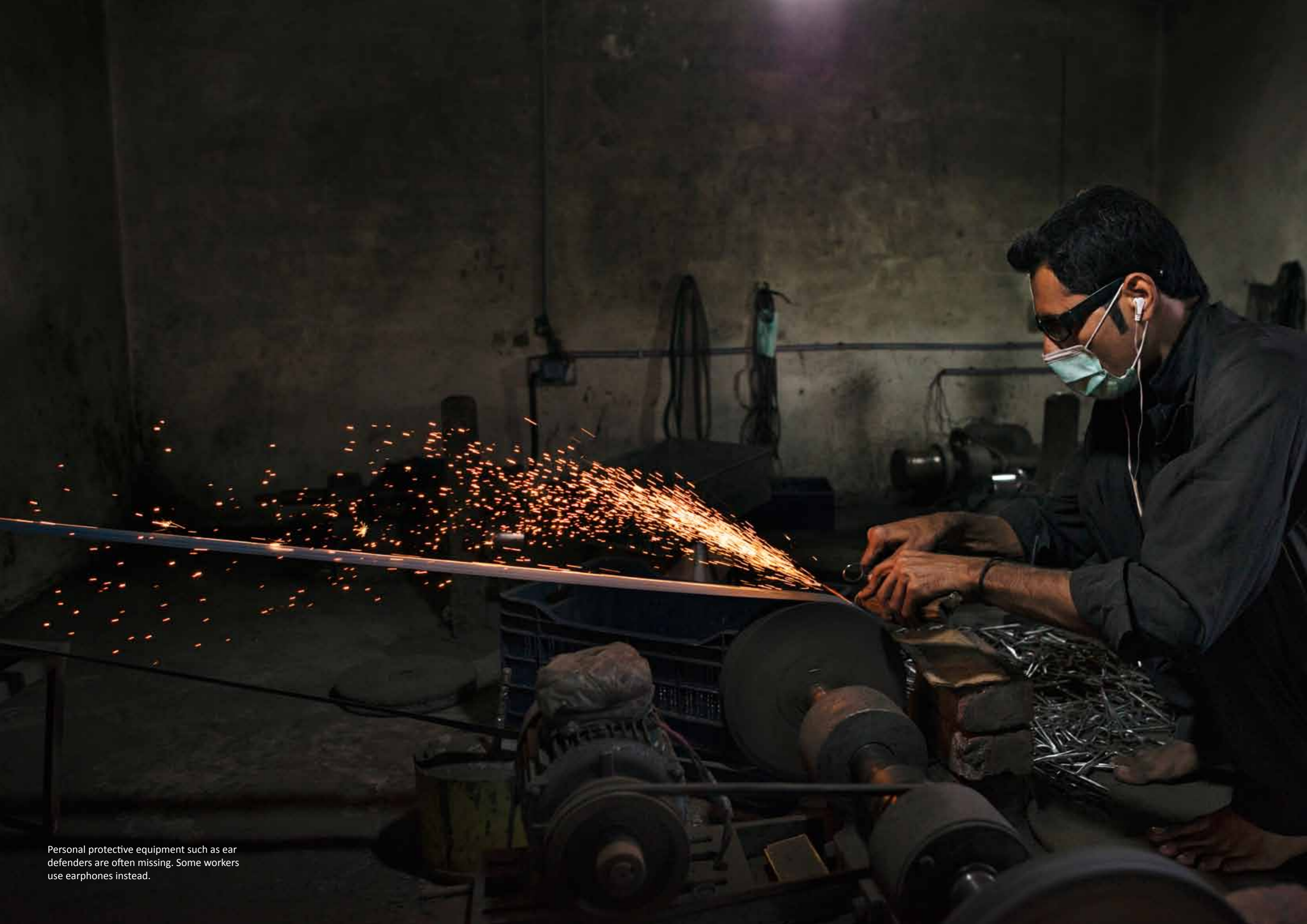
Personal protective equipment such as ear defenders are often missing. Some workers use earphones instead.