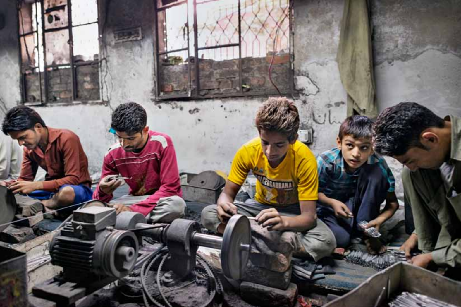
Child labour is still common practice at the general vendors and a risk buyers need to consider and mitigate.

In the event of an injury, which the workers agreed did happen frequently, all medical costs are covered by the firm.