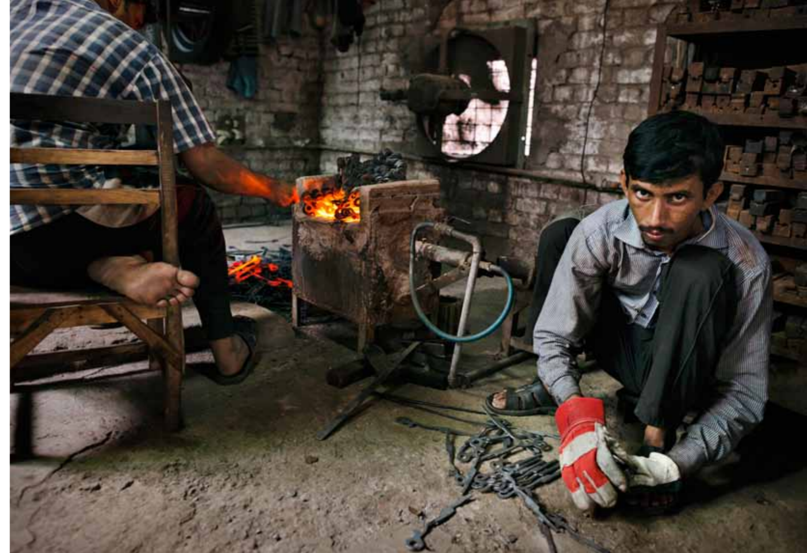
Forge workers in Daska - inadequate working environment and lack of personal protective equipment.

United Nations, The Road to Dignity by 2030: Ending Poverty, Transforming All Lives and Protecting the Planet – Synthesis Report of the Secretary-General On the Post-2015 Agenda , New York, December 2014, http://www.un.org/disabilities/documents/reports/SG_Synthesis_Report_Road_to_Dignity_by_2030.pdf .