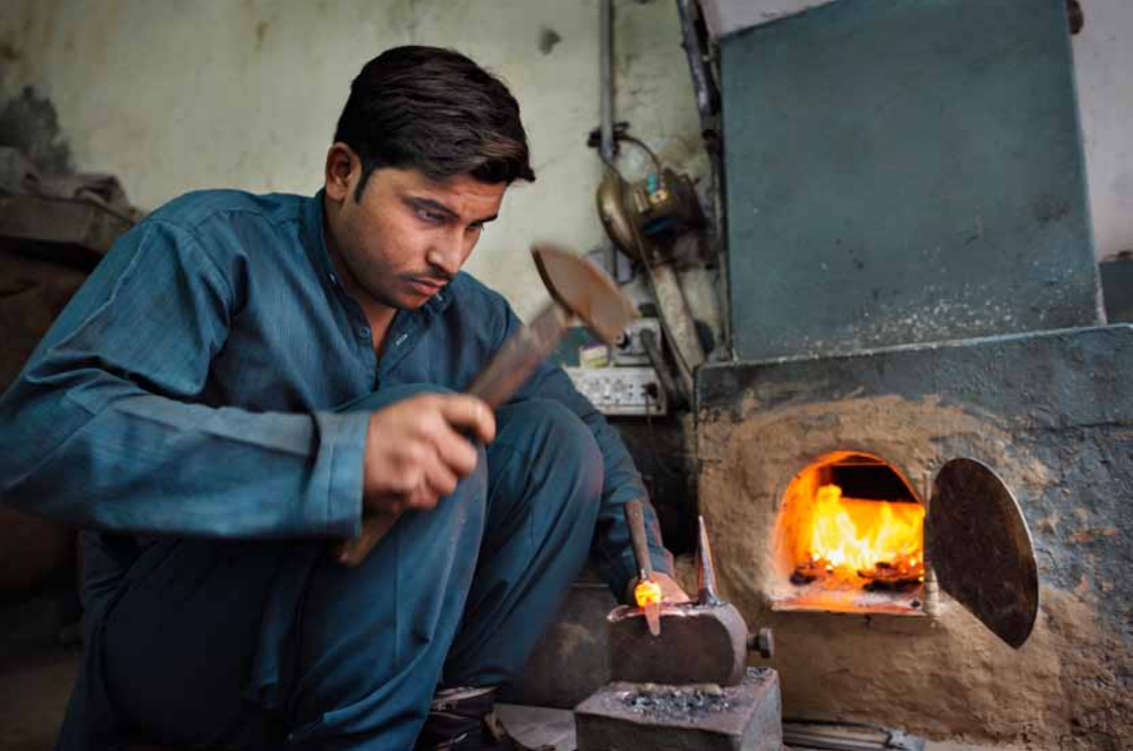
Early stages of production at a sub-contracting unit. The worker lacks personal protective equipment.

A comparison of the prices of IM-Medico and Instrumenta, to the county councils, shows that they are more or less the same, although IM-Medico generally sells for a marginally higher price. Although IM-Medico has not increased their prices since 2007, this shows that the 14 % increase by Instrumenta still puts the companies at almost the same price level today. 35