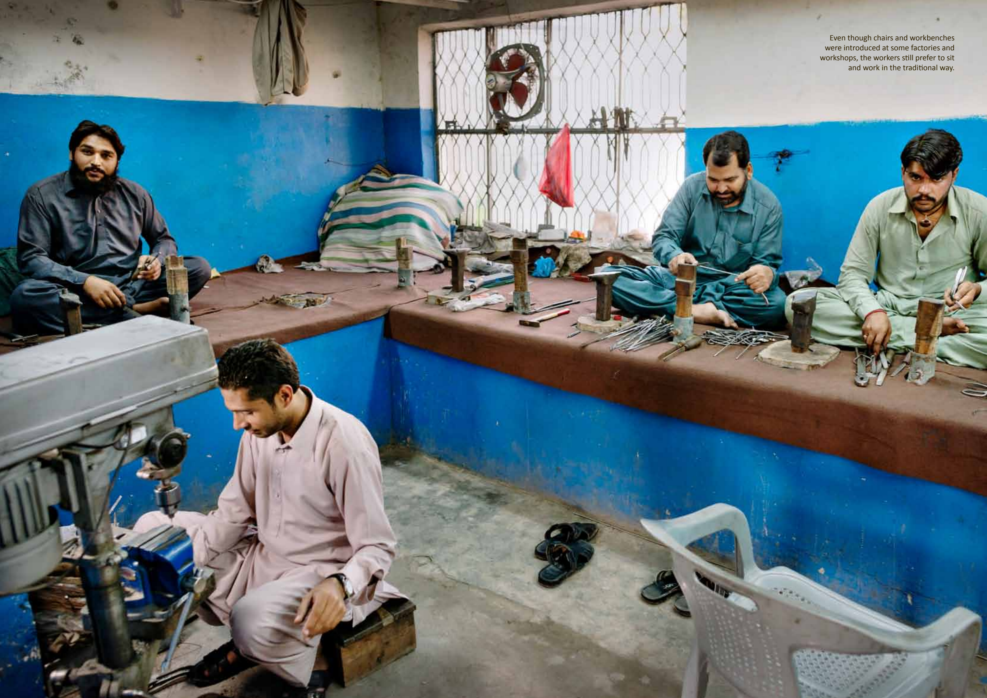
Even though chairs and workbenches were introduced at some factories and workshops, the workers still prefer to sit and work in the traditional way.