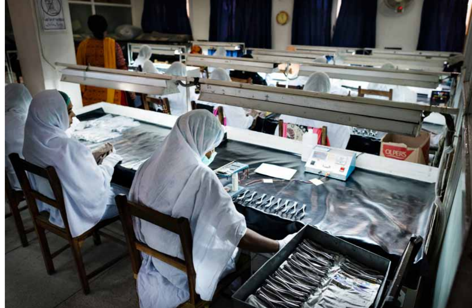
Of all visited factories only M.A. Arain employed women, which indicates that gender inequality is an area for improvement.

their prices since 2007. During this period the cost of electricity has increased, and almost doubled over the last year.